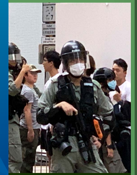
Hong Kong security forces