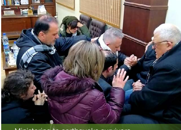
Ministering to earthquake survivors

In Iraq, the Gulf war brought thousands of Kurdish people to Christ, after years of little fruit. Within a year of the brief war, God grew the Church in Kosovo from 58 believers to over 3,000 converts—now there are 43 churches across the country. Civil war in Syria brought two million refugees to Lebanon-now we see tens of thousands of Syrians filling churches in Lebanon, Turkey, and Jordan.