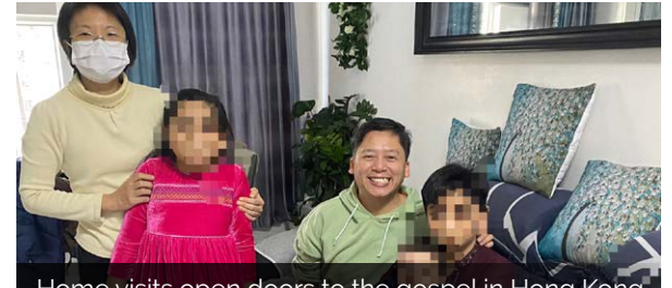
Home visits open doors to the gospel in Hong Kong

These outreach teams are equipped through discipleship and evangelism training events that are held four times a year. In the last 12 months, HIA has trained more than 100 people to effectively reach Muslims. Pray for salvation for the many Muslim families in the area, and for new believers to grow in discipleship.