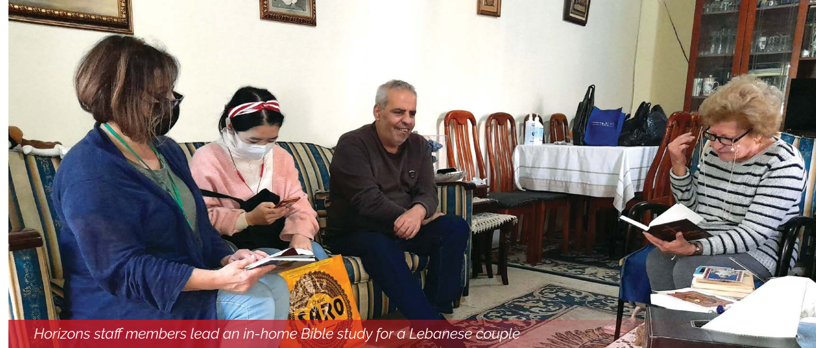
Horizons staff members lead an in-home Bible study for a Lebanese couple

God led Horizons to create what is now the Lebanon Crisis Fund so that we could tangibly demonstrate the free love of Jesus to communities in need of recovery. We praise God that this initiative is already producing a harvest of souls who want to know Christ —and God willing, we look forward to many more!